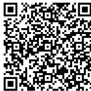
Assistant Registrar (Examination) सहायक कुलसचिव (परीक्षा)

The Degree Certificate of the University of Delhi will be issued to her after the convocation of the University.