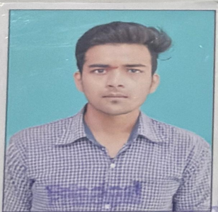
Chinmaya Degree College BHEL, Haridwar

Principal Chinmaya Degree College BHEL, Haridwar